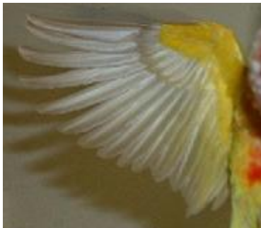
Pineapple with “epaulets” and bright underwing