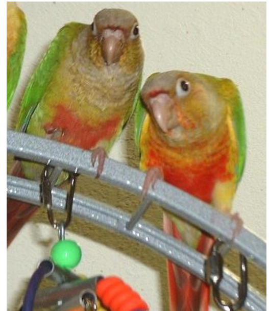
Cinnamon (left) and Pineapple (right)

A cinnamon-yellow-sided, or “pineapple,” is a visual color manifestation resulting from a combination of color genes which then exhibits characteristic colors of both cinnamon and yellow-sided. When compared to a cinnamon, a pineapple should have extra red and yellow (particularly notable under the wings), and sometimes there will be “epaulets” of red and yellow on the upper bend of the wing. In a cinnamon, the yellow will have a lime green cast to it (check under full spectrum light), whereas the pineapple’s yellow will be bright with no lime green cast. The cinnamon will not have reddish orange around the lower mandible feathers, but the pineapple usually will, and in addition, will have some red above the cere. The pineapple’s tail will also be telltale of the yellow-sided influence, so that if you look at the tail feathers from above, you will see a slight “halo” of lighter color around the tips of the feathers (particularly noticeable in young birds). This also gives the tail an almost translucent red tinge. The cinnamon color will be more muted and will not have that “halo.”